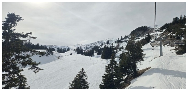
Trento and Hotel Cristallo